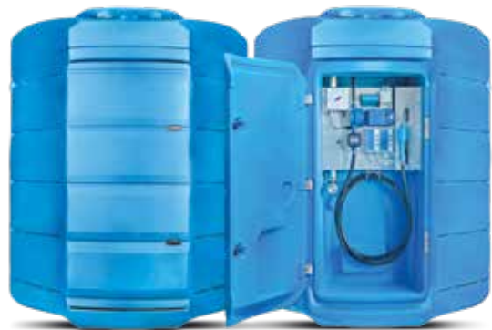
Part No. DEFPNP1320 (1,320 Gallons)