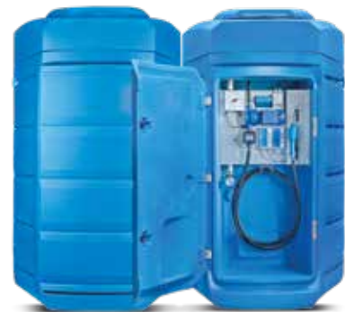
Part No. DEFPNP660 (660 Gallons)