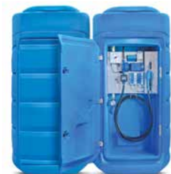
Part No. DEFPNP396 (396 Gallons)